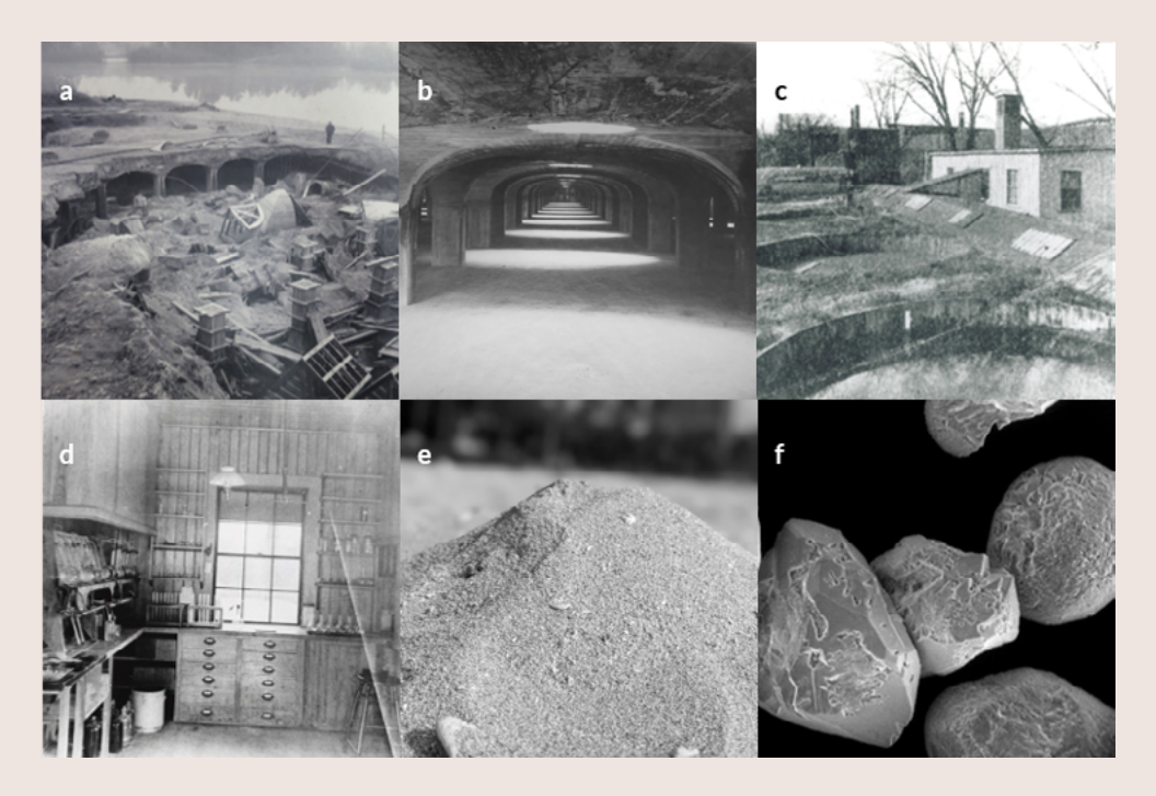
Figure 2: Multiscale view of water filtration and infrastructure materials, structures, systems.

a) Construction of water infrastructure system, 1907, Lawrence, Massachusetts. iment Station, Lawrence, Massachu-Source: Lawrence, History Center 'Water Filtration Construction Photographs' ICA 2002_063_476. 90.148.14A April 4th, 1907.