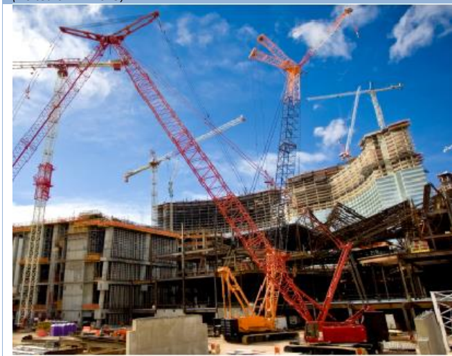
Figure 1 A typical building construction.

Within the area of public procurement, one particularly relevant and potentially sizeable risk is the construction risk in works contracts or other forms of contract, such as concessions or public-private partnerships. In this paper we shall consider construction risk essentially as the risk of deviation with respect to the costs budgeted for the works, for various possible reasons: incorrect specifications or measurements in the design, work delays, changes in the prices of inputs, unforeseen geotechnical problems, etc. Administrative procedures in many different countries reveal a series of different methods for