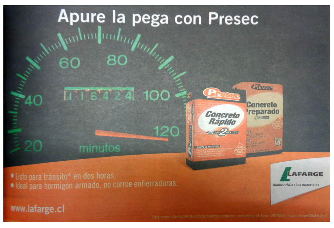
Figure 6. Presec.

Acceleration is, broadly speaking, a phenomenon that tends to the reduction of chronological time and, consequently, to an increase in the capacity of the subject, since it can carry out more actions at a given time. It is a phenomenon referred to the duration and shortening of time. This phenomenon is actually present in the advertising narrative (an example