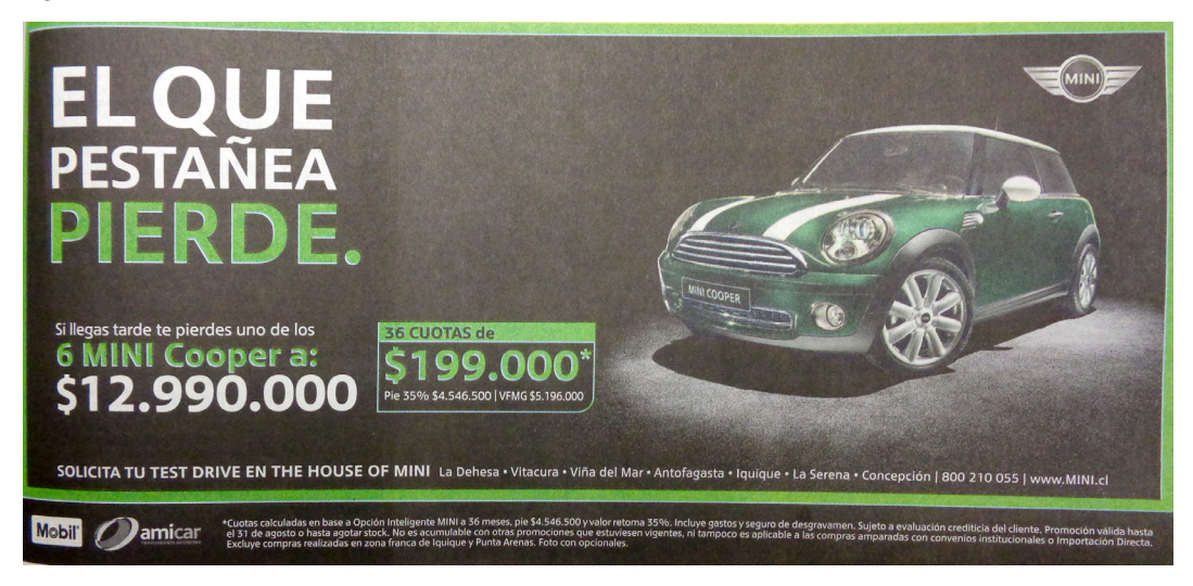
Figure 8. Mini.

Year 2010