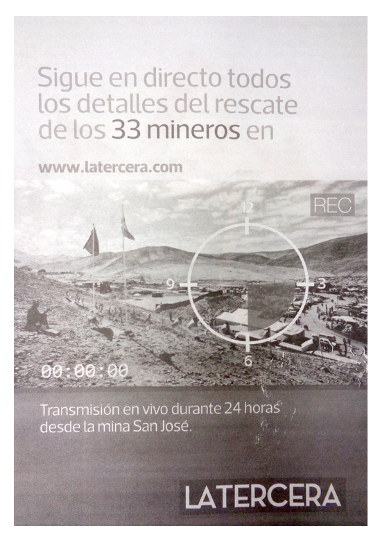
Figure 2. La Tercera

Year: 2010