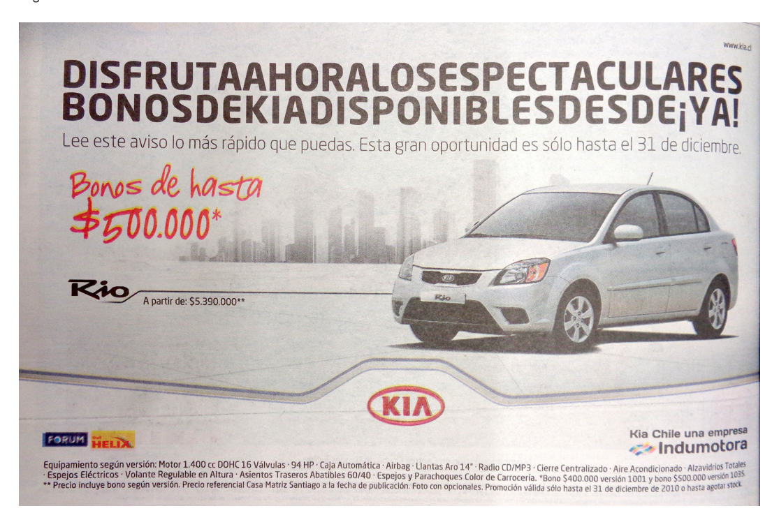
Figure 7. KIA.

Grammatical structure and language rules are a form of rationality in the world, allowing order from a causal logic relationship. Grammar constructs a hierar-