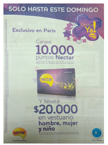
Figure 3. Items belonging to the brands and labels: Paris - Nectar / Unimarc / Ripley.