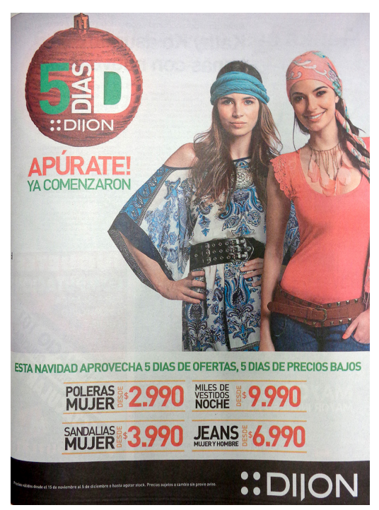
Figure 9. Dijon.