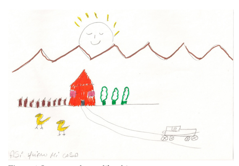
Figure 6. I want my house like this one.