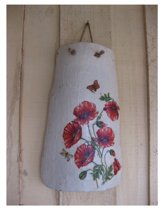
Figure 2. Adornments made of adobe slabs.

Also, examples of art making occurring in the community primarily focused on crafts made to sell, in order to make a living. An example of these are the adobe slabs that were remnants of fallen houses, which one temporarily housed community utilized to make wall adornments to sell (Figure 2). These artistic responses are juxtaposed with research coming from the United States and Europe (e.g., Bardot, 2008; Coholic, 2011; Prescott et al., 2008), depicting art used predominantly for personal expression of feelings, processing traumatic events or communicating one's experience.