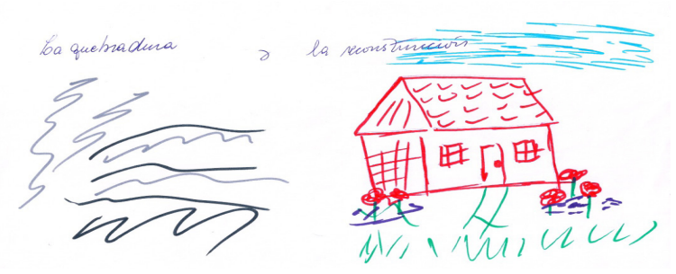
Figure 5. María Eliana's drawing: The breakage and the reconstruction.